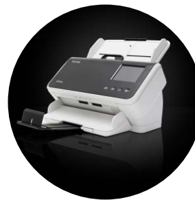
Kodak S2060w/S2080w Scanners