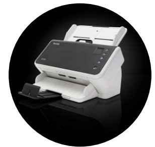
Kodak S2040/S2050/S2070 Scanners